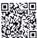
Director R.D. Engineering College Duhai, Ghaziabad